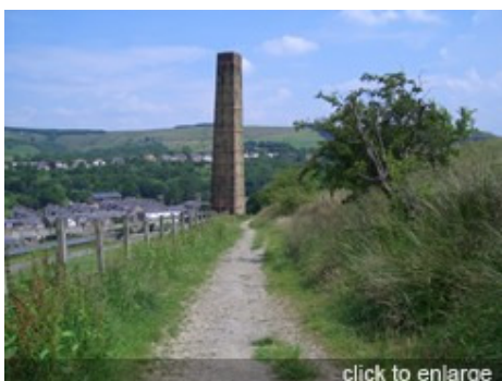
Detached chimney above Greenbridge Works, Rawtenstall. The flue up the hillside gains height to the chimney