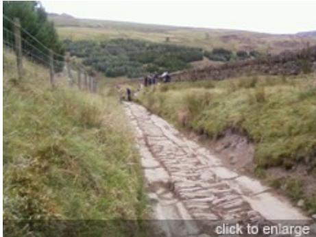
Old causeys clearly rutted by stone trucks, Cowclough Rake, Cowm