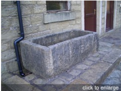
Large hand carved stone trough, New Hall Hey. Rawtenstall.