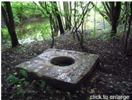
Hand carved manhole cover in flagstone, Alder Bottom, Edenfield