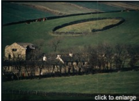
Grade II listed circular tree guard, later sheep pen, Cow Toot, Bacup