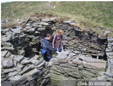
Quarryman's hut with more complex entrance, Ab Top Quarry