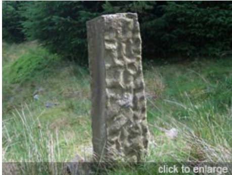
Strong ripple marks in gate post, Grove Head, Grane Valley