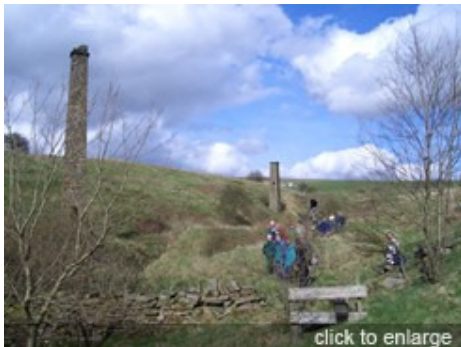
Early chimneys - the transition from water to steam power, Bridge Clough, Waterfoot