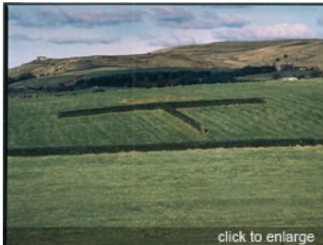
T shaped wall pattern for sheep shelter near Plunge, Edenfield