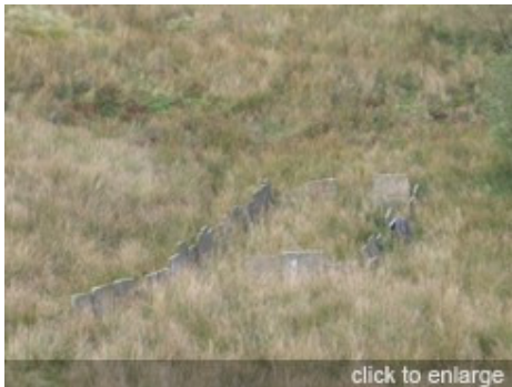
Unusual flag fence sheep fold at Back Cwm, Whitworth