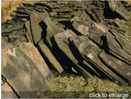
Stacked grey (stone) slates with peg holes, Halsingden Grane