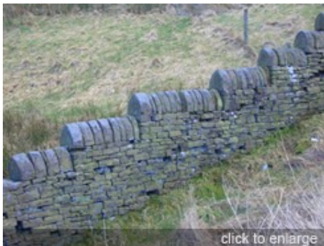
High quality stepped waterboard walling. Spring Mill, Whitworth