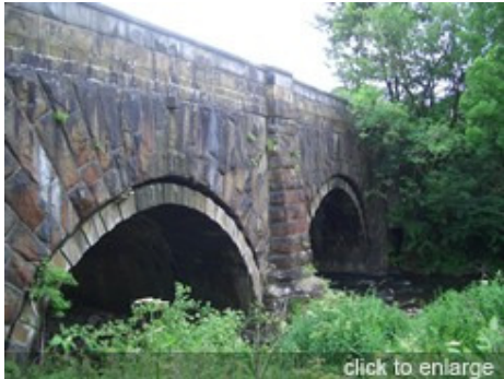
Turnpike road bridge over early pack horse bridge at Ewood Bridge