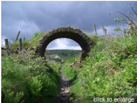
Eye catching bridge over Old Lane, purpose unknown, Cow Toot, Bacup