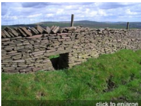
Wall with flag stone over sheep creep, Bacup Old Rd