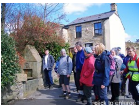
'Spewing Duck' well at Goodshaw Fold, the trough is created by flagstone slabs