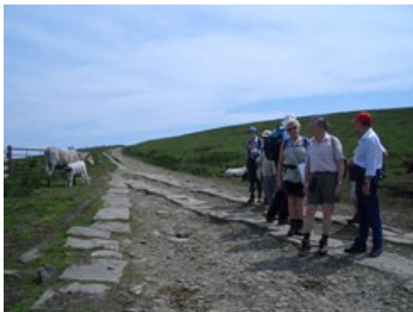
A junction of 2 sets of stone causeys some ruttred by early stone truck, Rooley Moor Rd, Cowpe