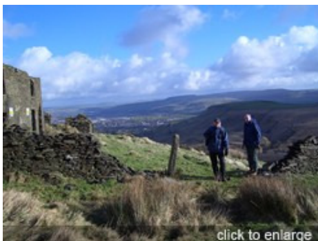
Gate post and ruins at Causeway Head, Musbury Valley