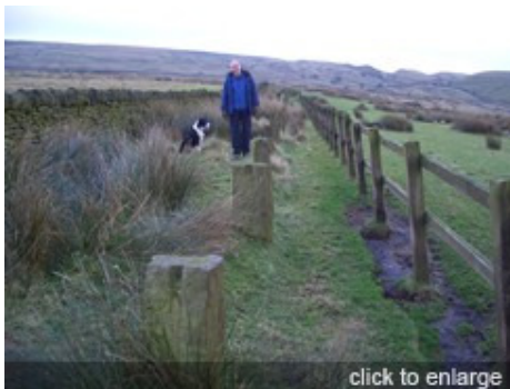
Distinct stone row - 'a stretcher gate' for drying warp, Thimble Hall, Watergrove