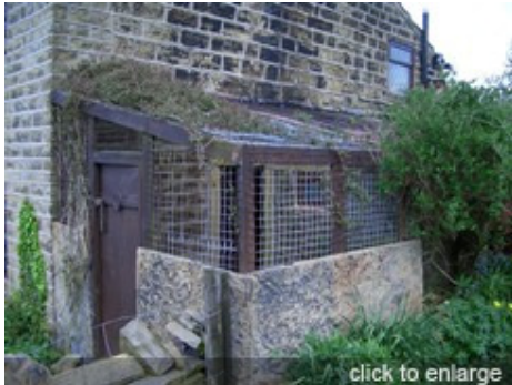
Flag fence modified to farm porch Moss Meadows Farm, Stacksteads