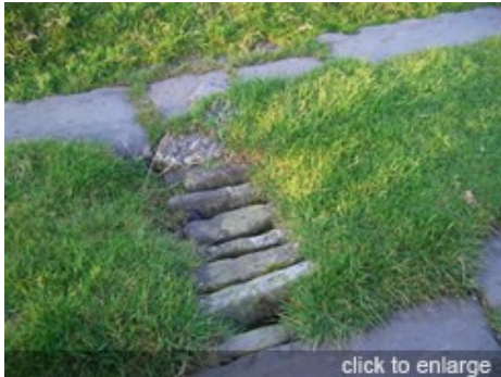
Primitive use of stone to create a grate, Hud Clough, Whitworth