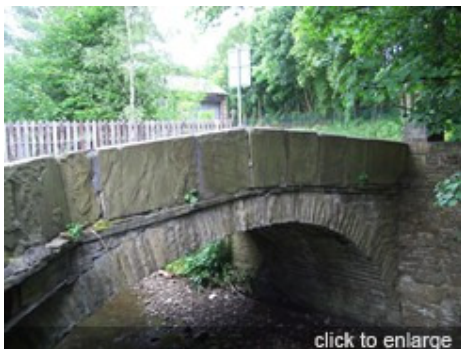
Flag stone parapets on bridge over River Ogden, Irwell Vale