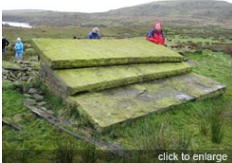
Large flagstone roof near Thimble Hall, Watergrove