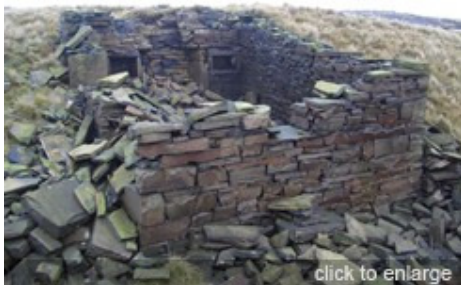
Quarryman's hut with stone cupboards and chimney, Cragg Quarry