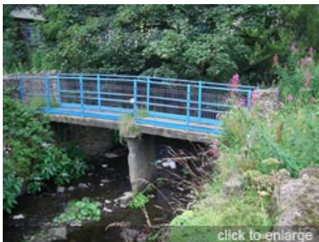
Flag stone spans and support on clapper bridge at Hippins, Waterfoot