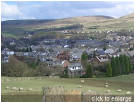
Stepped profile flag fence at Cock Hall, Whitworth