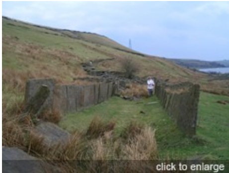
Double row of flag fencing at Back Cwm Farm