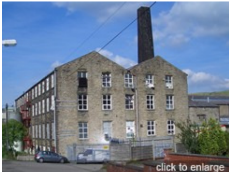
Lancashire Sock Co., Britannia, watershot stone work, square chimney