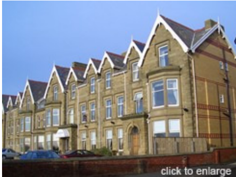
Porritt Houses, St Annes, stone exported from Porritt's Alden Quarry