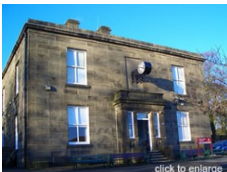
Mill owner's mansion, later Whitaker Park Museum. Ashlar stonework.