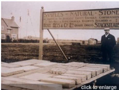
Early trade stand of urban stone products for export all over