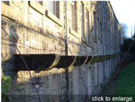
Remnant supports for landings, Barlow Buildings, Rawtenstall