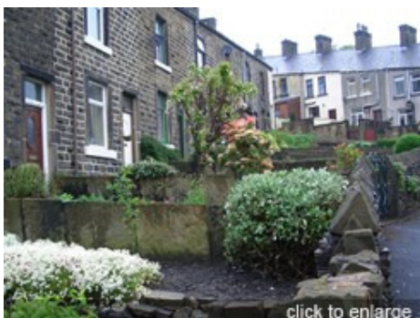
Superb urban flag fencing in Rawtenstall, St Mary's Place.