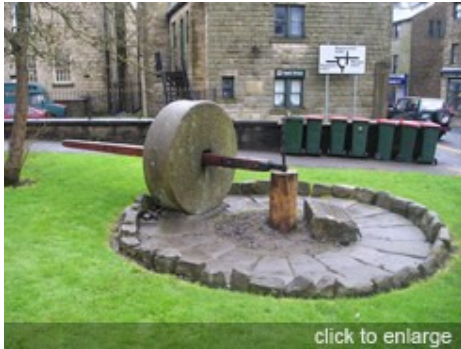
Stone & circle for crushing sand - sand knocking, Wall of History, Bacup.