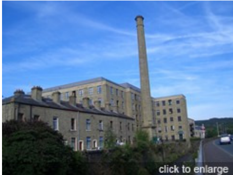
Ilex Mill dominates central Rawtenstall, built in 1856 for David Whitehead, mainly pitch face stone work