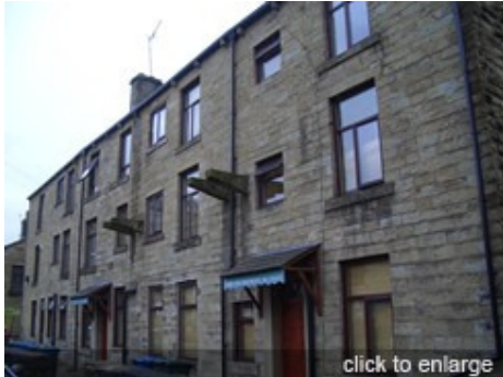
Stone supports for water vats, car-park, Waterfoot