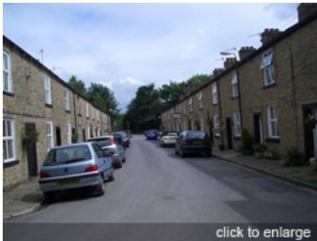
A model industrial village, Irwell Vale, Bowker St dated 1833