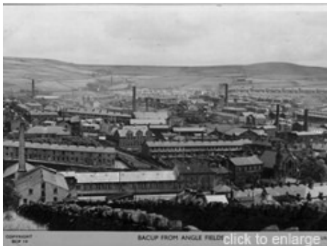
Bacup circa 1950, the best preserved stone built mill town in Rossendale