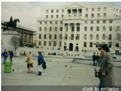
Repairs to Trafalgar Square (1987) using Scout Moor stone to replace original Britannia quarried stones