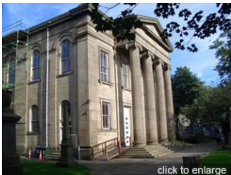
Neoclassical style and massive ashlar stonework, Longholme Chapel, Rawtenstall