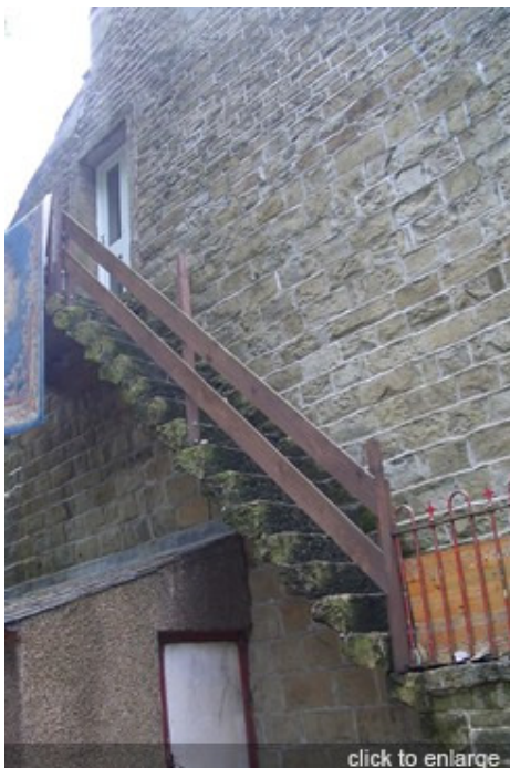
Cantilevered 'taking in' steps to upper work floor, Newchurch Rd, Stacksteads.