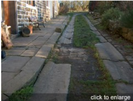
Flag Street, Stacksteads with surviving early stone products