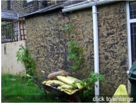
Large ripple flag stones utilised as an outhouse, Gordon St, Rawtenstall