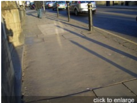
'Alleged' country's largest flag, 10 square feet. Colne Town Hall. From a Cloughfold Quarry