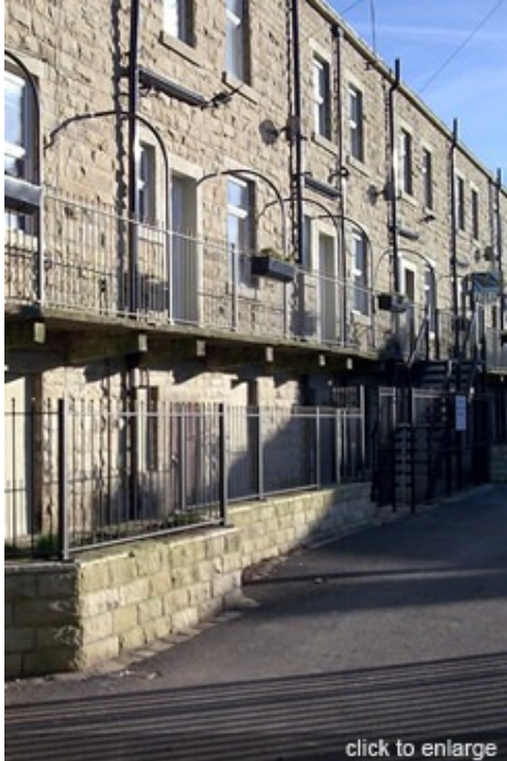
Characteristic flag stone landings back Newchurch Rd, Stacksteads