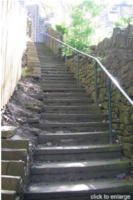
'Cat steps' usually short cuts or 'snickets' Greenfield St, Rawtenstall