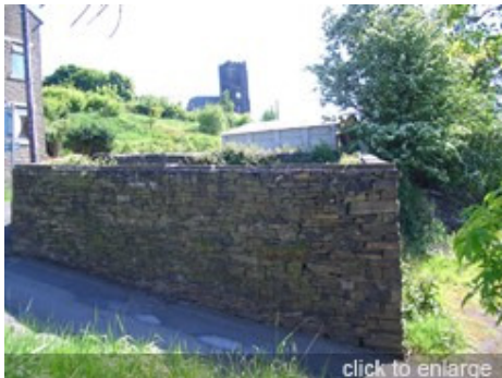
Early stone built pinfold for penning stray animals, Haslingden