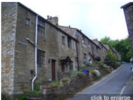
Unusual stepped profile and flag stone door canopies, Step Row, Bacup