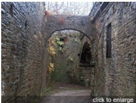
Arched buttress between mill and railway viaduct, Higher Mill, Helmshore