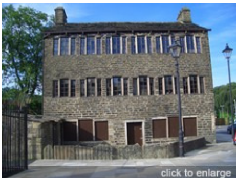
Weavers' Cottage, Rawtenstall c.1780, distinctive triple step windows