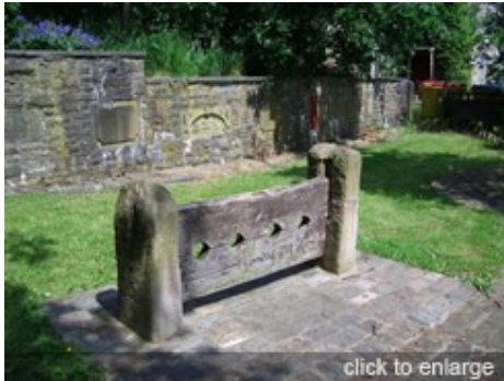
Gritstone supports for old stocks, Wall of History, Bacup