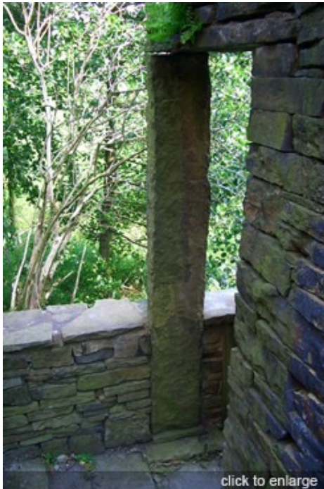
Very tall, slender flag support, Market St, Shawforth