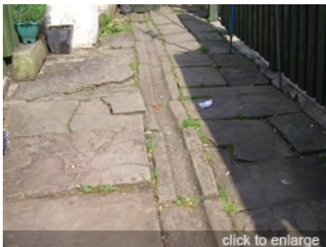
Carved stone channel, nr Bin St, Crawshawbooth.