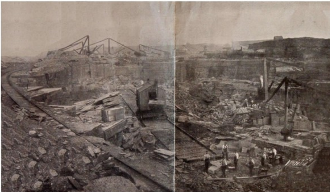
Massive scale of activity in Siddalls Quarry, thought to be Back Cowm

In 1888, a Bacupian visiting Back Cowm received: "one of the surprises of my life...Not having visited the place for over 30 years, I went the other day, but could not find a single landmark of my youth. Standing on the slope of the hill, looking across the valley at the magnitude of the undertakings there, I tried to count the number of steam and hand cranes, but it was impossible."